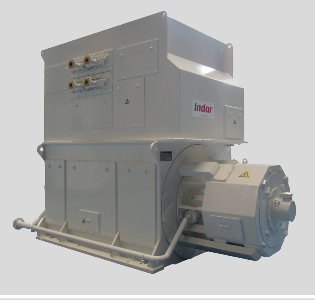
Flash Geothermal Plant

Geothermal plant with flash technology in Olkaria Kenya, consisting on five generating units of 7200 kVA each. Machines are specifically designed for H 2 S environment.