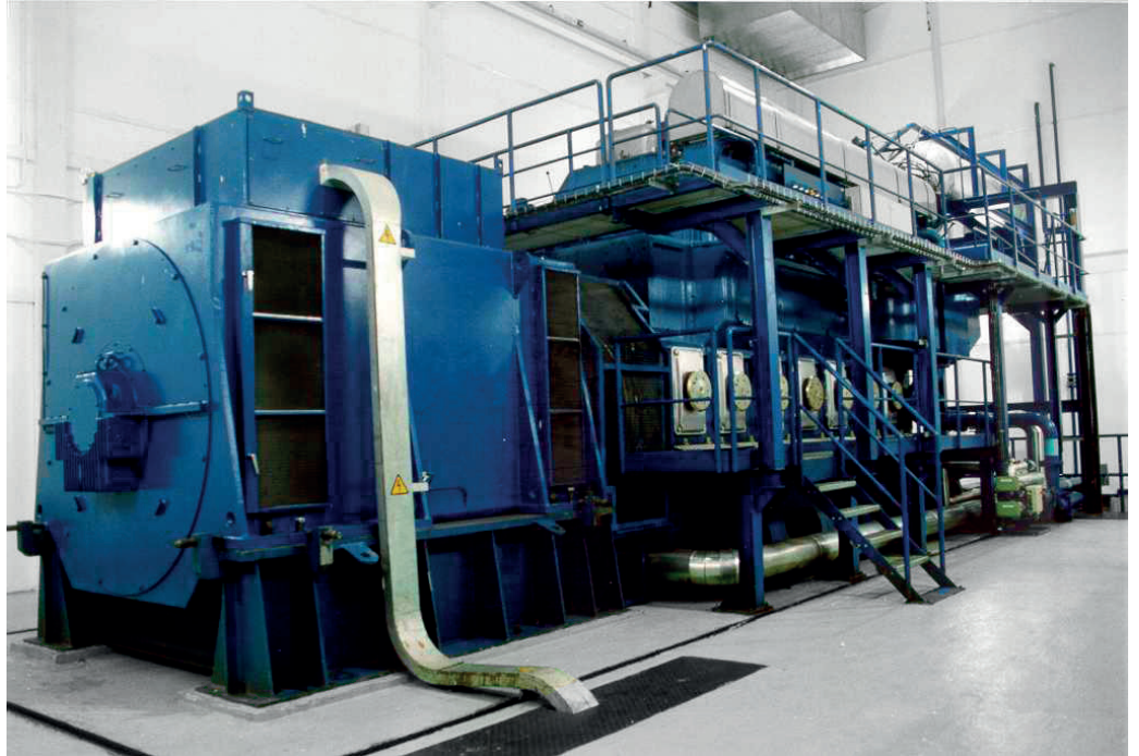
Subsea Construction Vessel