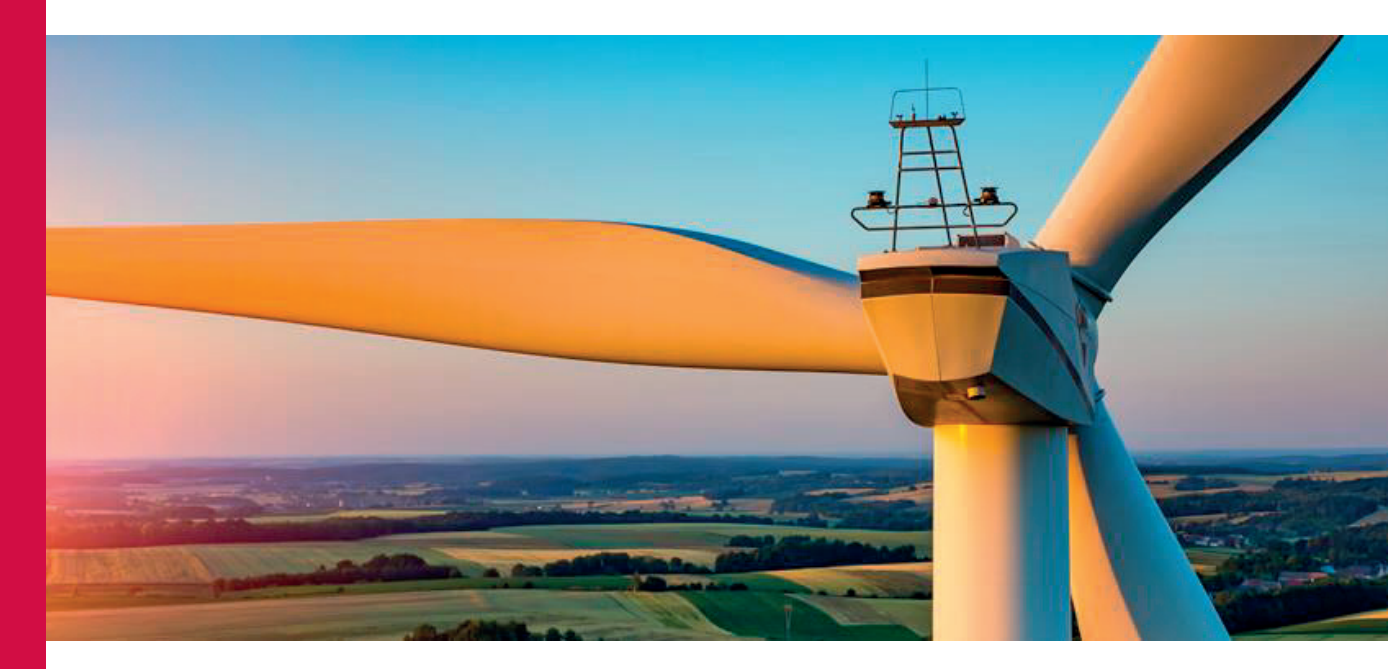
INDAR WIND ENERGY GENERATORS