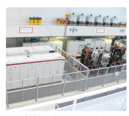
SSSC testing at Ingeteam's high voltage laboratory