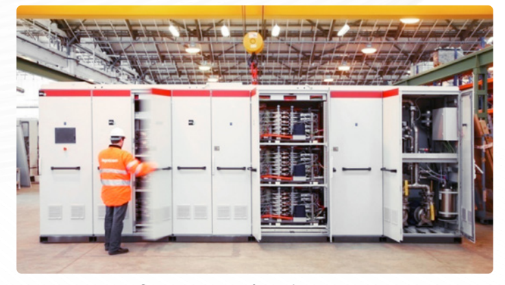
Converter manufacturing process