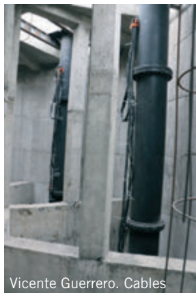
Vicente Guerrero. Cables

For many years, Ciudad de Mexico Water Authority (SACMEX) has developed a flood management plan. This plan includes New StormWater Pumping Stations and the retrofit of few of the old ones.