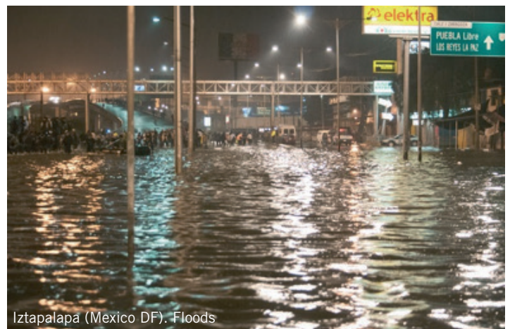
Iztapalapa (Mexico DF). Floods

A preventive flood risk management requires dependable pumping solutions. Reliable pumping equipment that operate fault free in a continuous mode during the rain event.