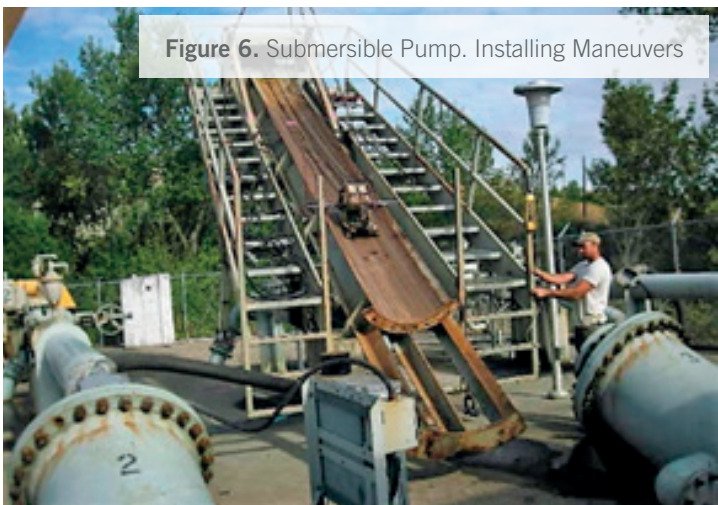
Figure 6. Submersible Pump. Installing Maneuvers