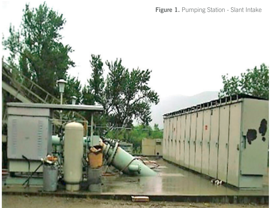
Figure 1. Pumping Station - Slant Intake