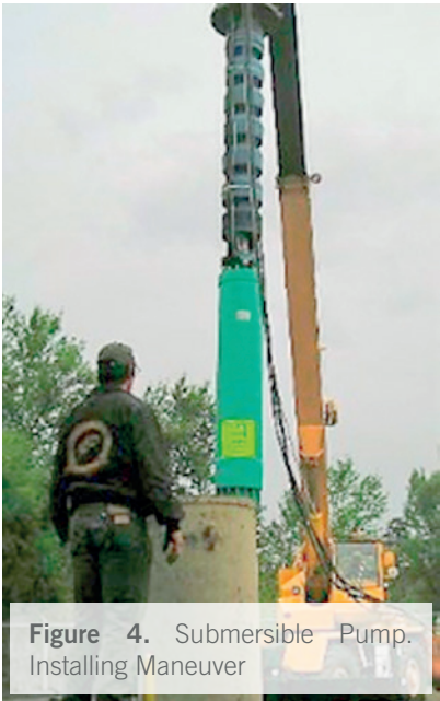
Figure 4. Submersible Pump. Installing Maneuver

The submersible sets for the slant wells were the best technical and environmentally friendly alternative due to the efficient use of water.