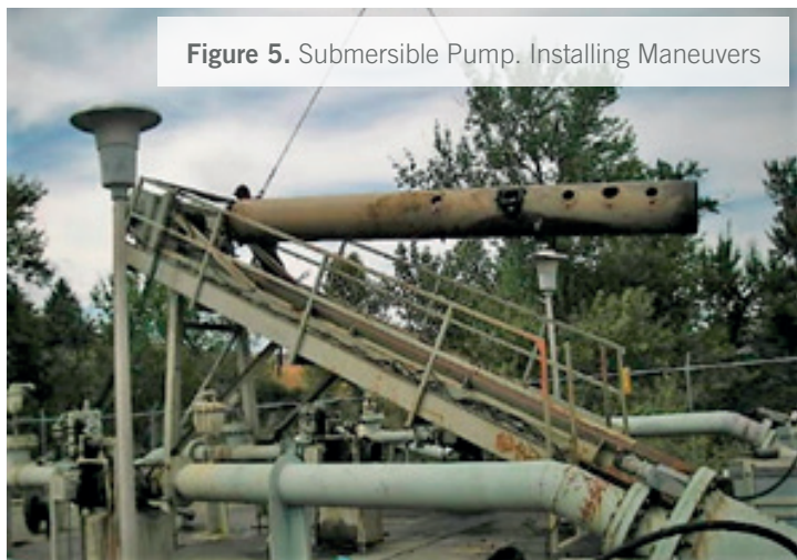
Figure 5. Submersible Pump. Installing Maneuvers