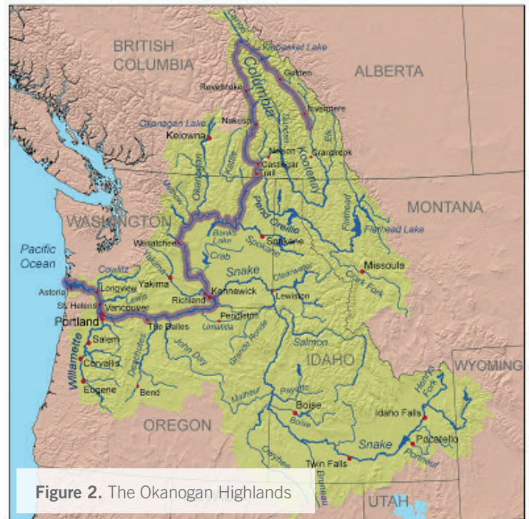
Figure 2. The Okanogan Highlands

Cordell Pumping Station (6 wells) takes water from the Okanogan River West Bank.