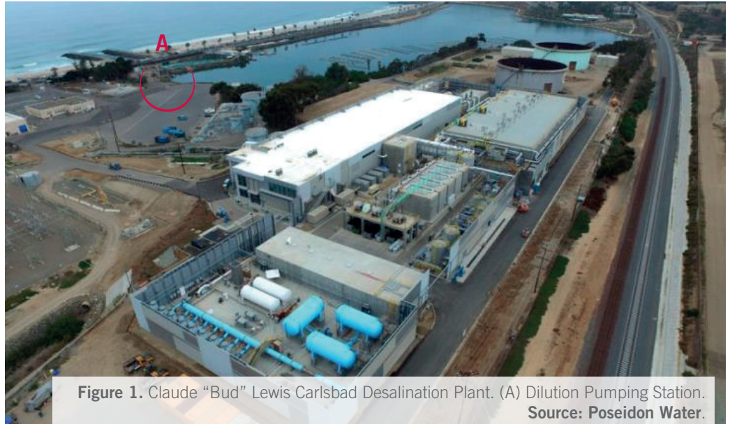
Figure 1. Claude "Bud" Lewis Carlsbad Desalination Plant. (A) Dilution Pumping Station.