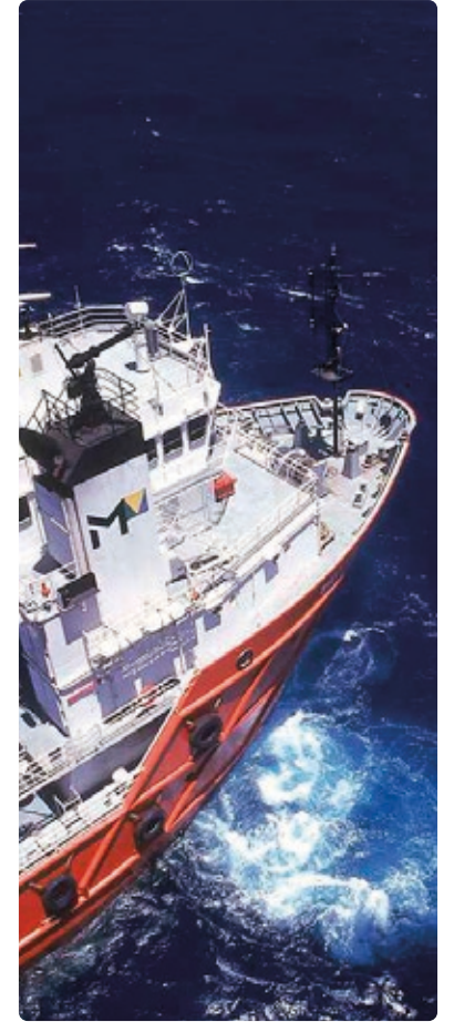
Applications: Metals, water treatment, cement, oil&gas, power generation, chemical and marine