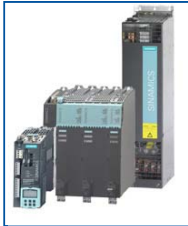
VUVF SINAMIC S120 Equipment