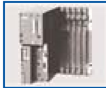
PLC Simatic S7-400