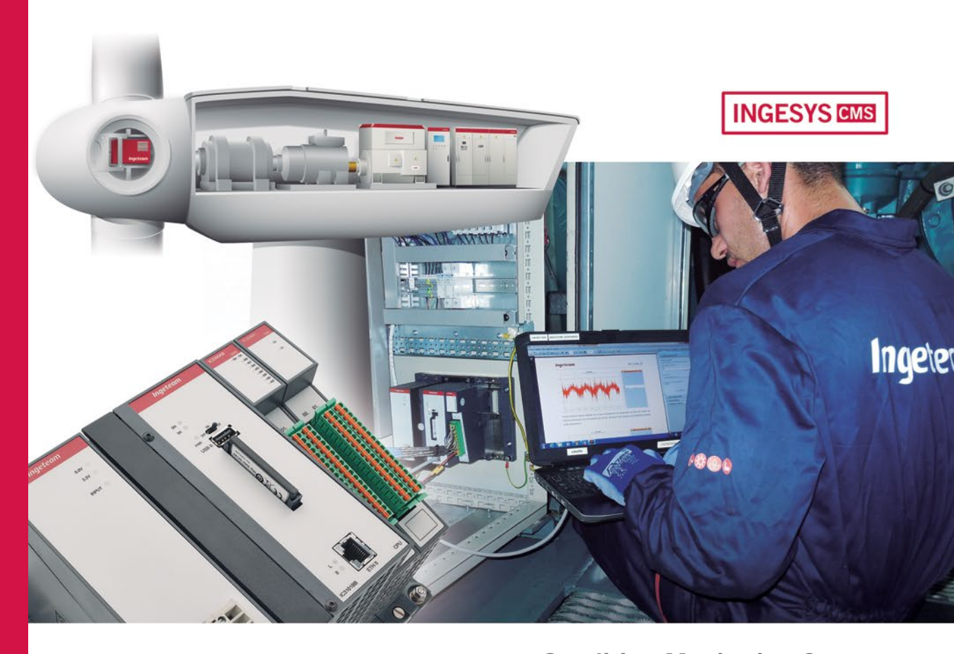
Condition Monitoring System