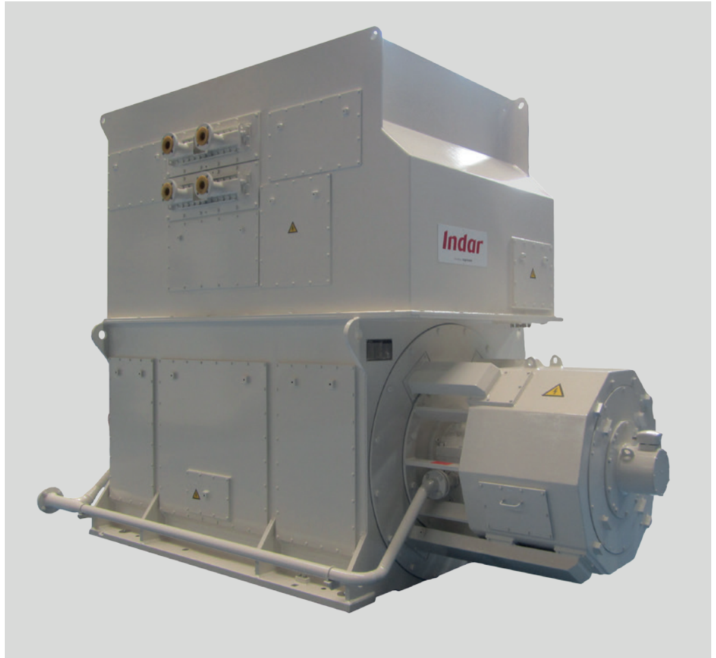
Flash Geothermal Plant

Geothermal plant with flash technology in Olkaria Kenya, consisting on five generating units of 7200 kVA each. Machines are specifically designed for H 2 S environment.