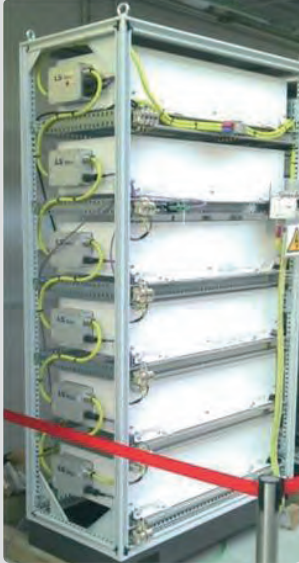
*Supplied as an integrator