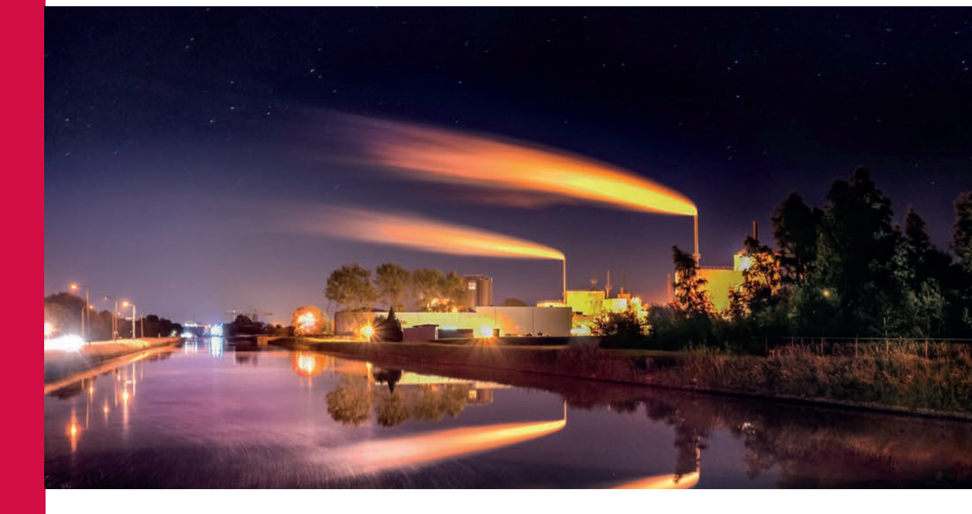
GAS & DIESEL POWER GENERATION