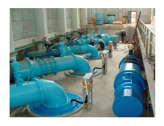
Operation & Maintenance costs