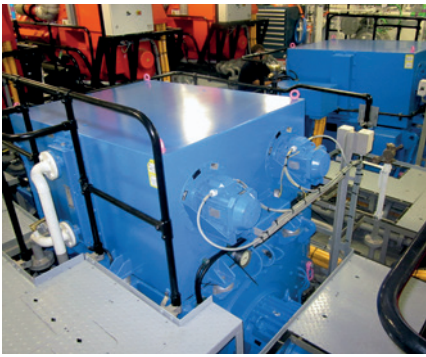
MARINE RESEARCH VESSELS LOW NOISE PROPULSION MOTORS