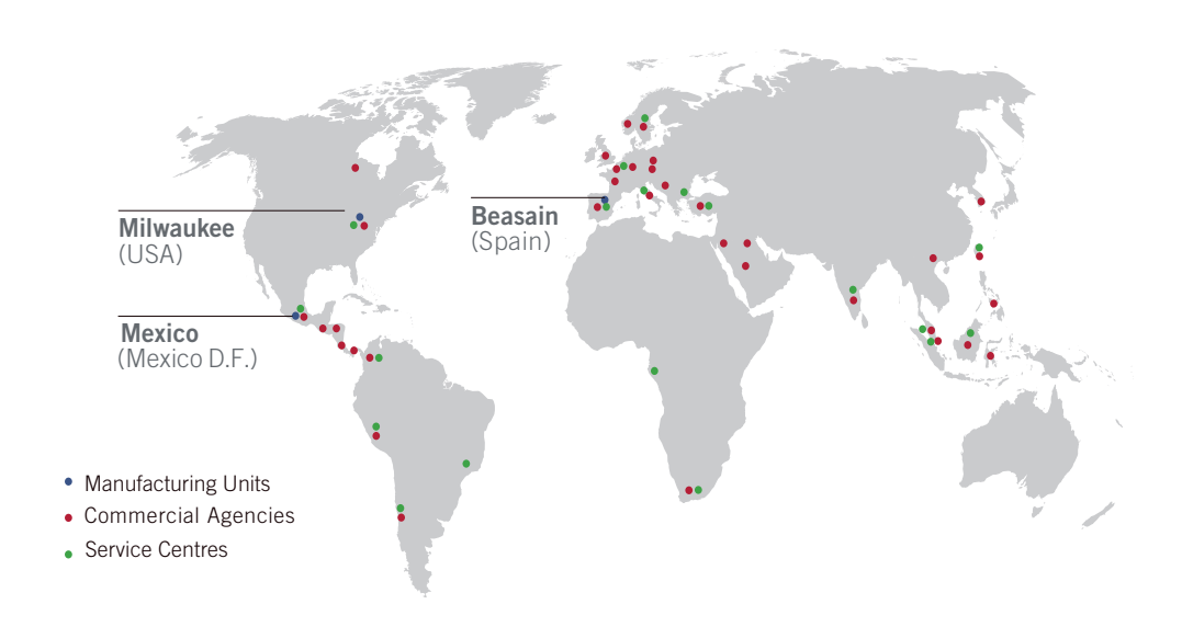
Your driving force