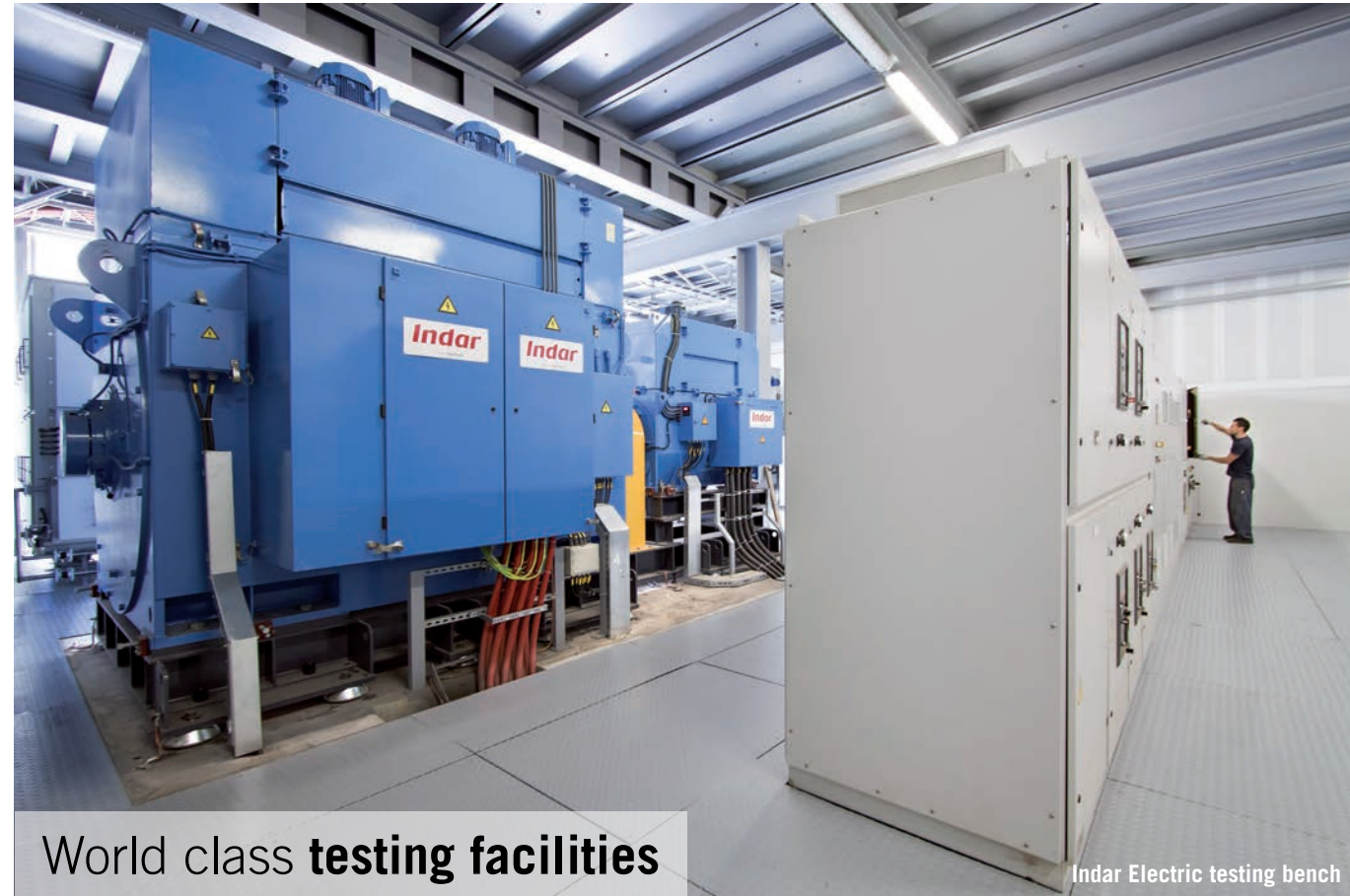
World class testing facilities

Cooperation with the client forms part of the philosophy of the company, with a personalized and unique treatment forming the basis of the relationship, and with a clear common purpose.